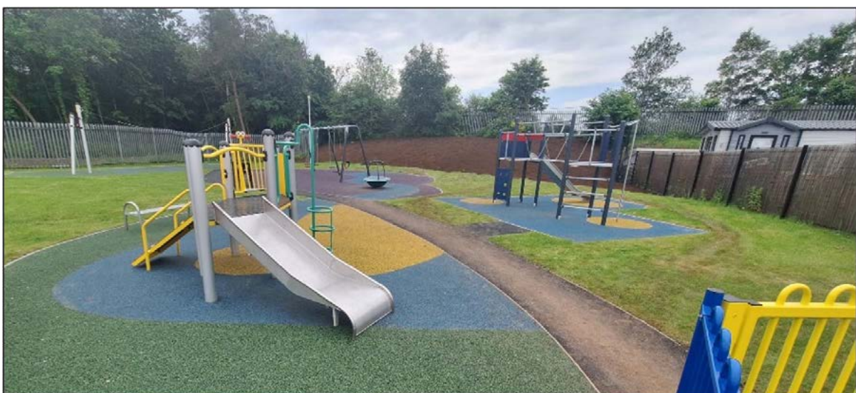
New play area at Shawlands Crescent installed, designed by children and young people on the site.

An additional outcome of taking a masterplan approach which involved residents in decision making, was the connection and ownership for improvement works this instilled in residents. For example, for the design of the play area at Shawlands Crescent, around 40 children participated in a dedicated engagement session where they selected the equipment and layout of the park. This inclusive approach not only fostered community buy-in but also aims to lead to reduced vandalism and greater respect for the space. Even residents who initially had concerns about noise or anti-social behaviour became supportive, as the park reflected the community's collective input and was installed by a local contractor familiar to the residents.