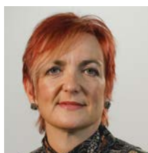
Angela Constance MSP

The Scottish Government and COSLA are firmly committed to ensuring that Equally Safe delivers real change for women and children in Scotland. To ensure this happens, we expect all VAW Partnerships to collect and share data on the quality standards and performance indicators included in this document on an annual basis, and use this to inform future strategic planning. We look forward to working with everyone in ensuring that we all live in a strong and flourishing Scotland where individuals are equally safe and respected, and where women and girls live free from all forms of violence and abuse – and the attitudes that help perpetuate it.